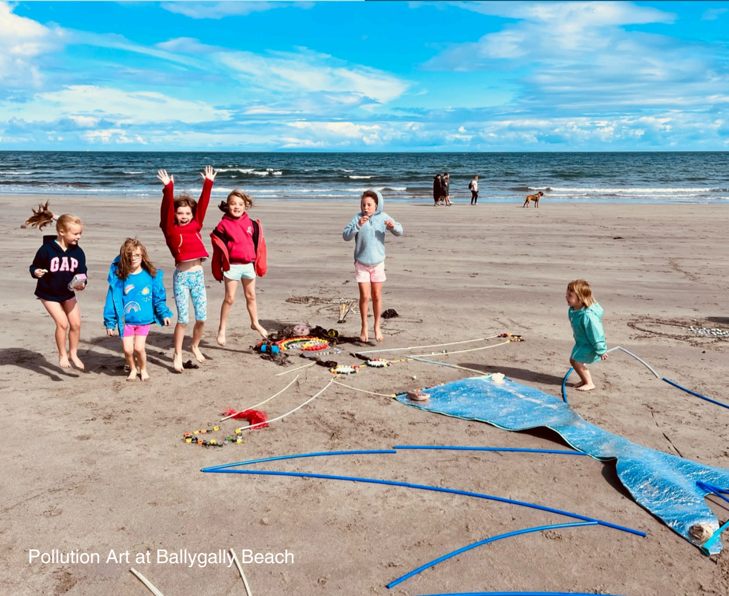
Pollution Art at Ballygally Beach