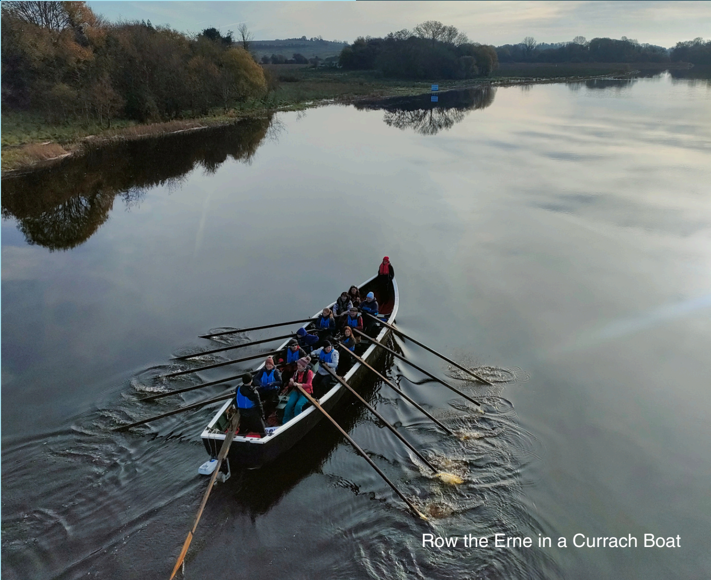
Row the Erne in a Currach Boat